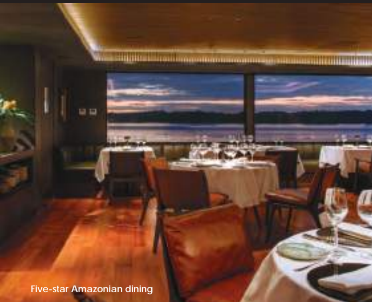
Five-star Amazonian dining