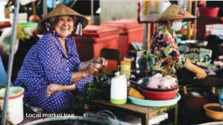
Local market tour