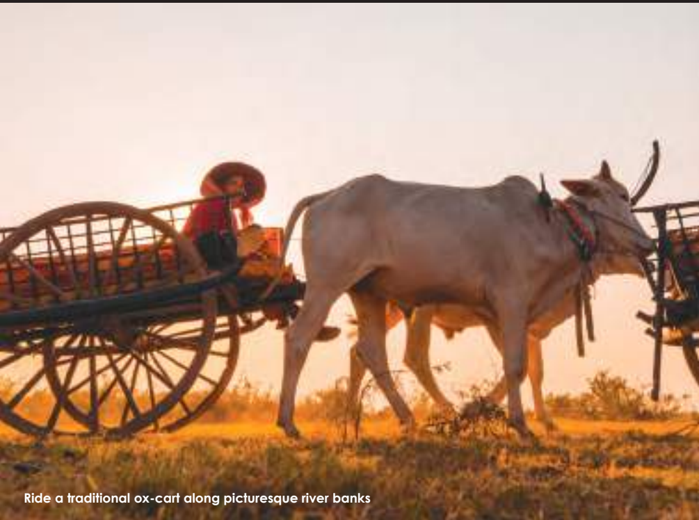
Ride a traditional ox-cart along picturesque river banks

FOLLOW OUR EXPERIENCED GUIDES AND EMBRACE THE RICHNESS OF THIS REGION'S CENTURIES-OLD CULTURE.