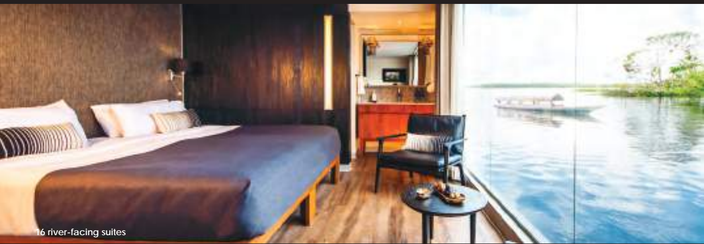
16 river-facing suites