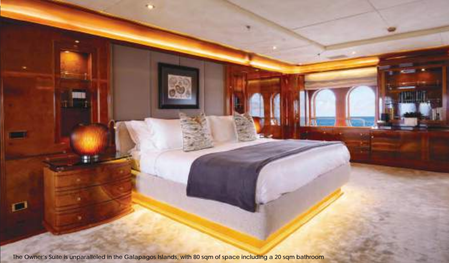
The Owner's Suite is unparalleled in the Galapagos Islands, with 80 sqm of space including a 20 sqm bathroom