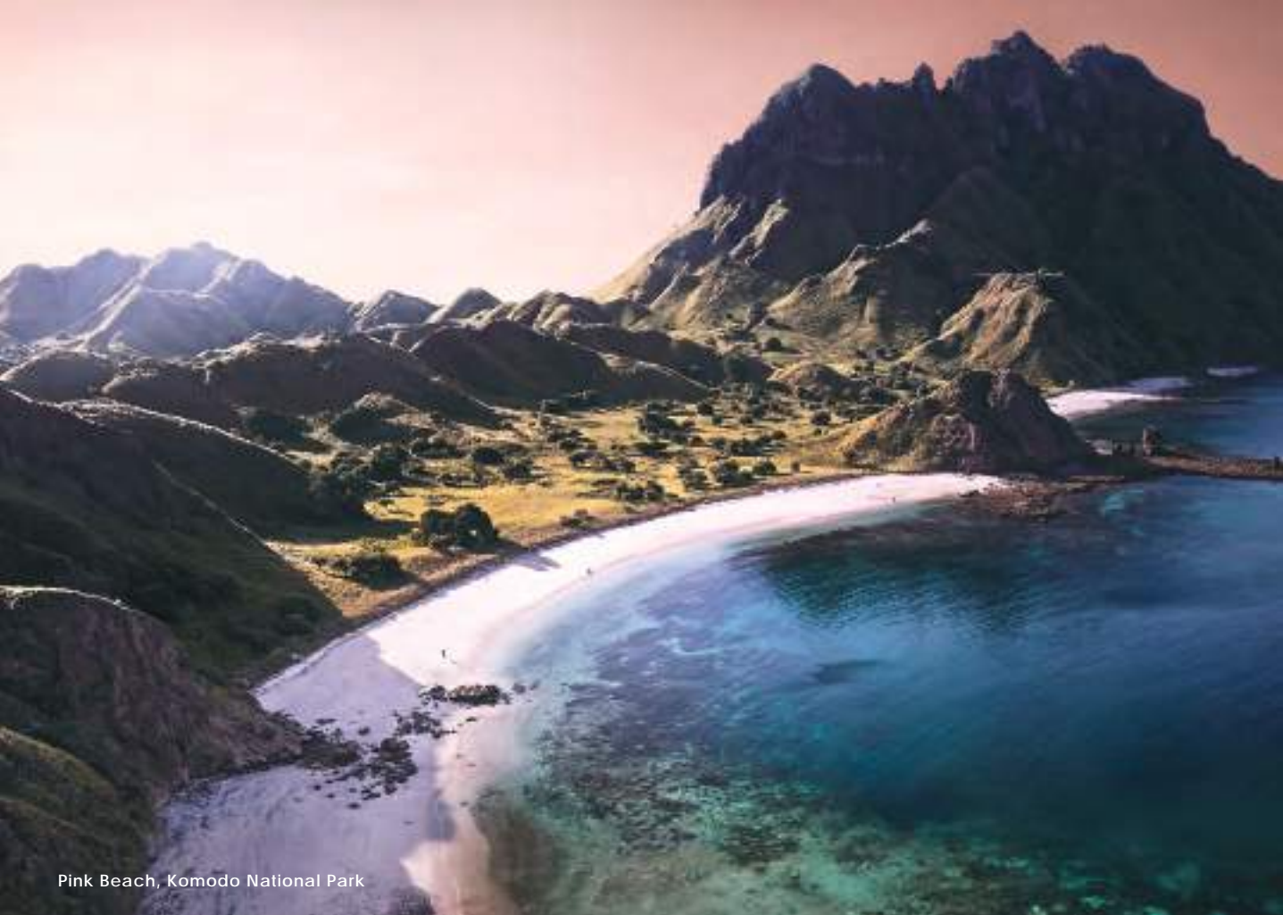
Pink Beach, Komodo National Park