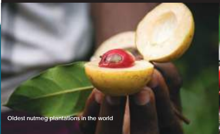
Oldest nutmeg plantations in the world