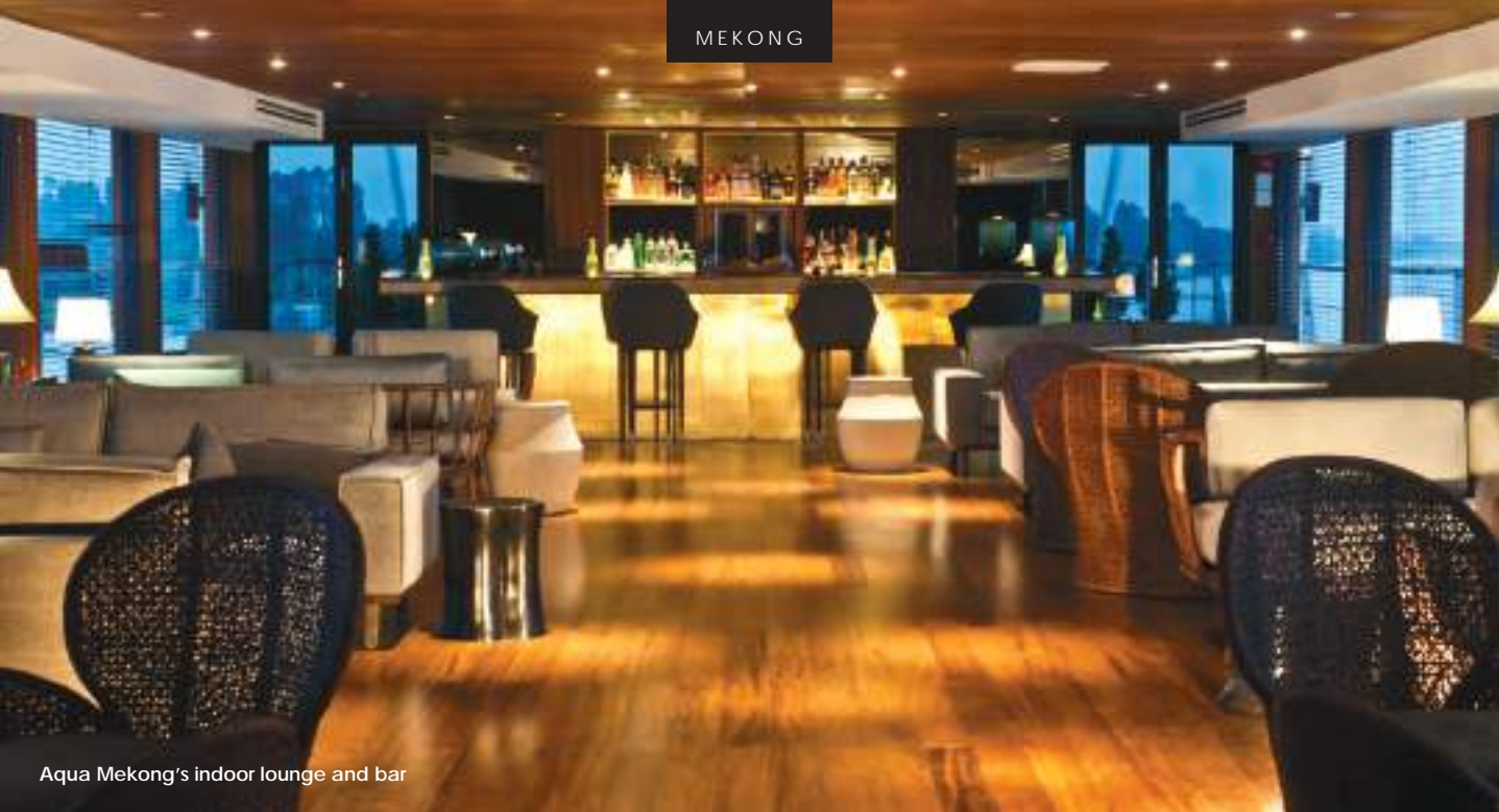
Aqua Mekong's indoor lounge and bar