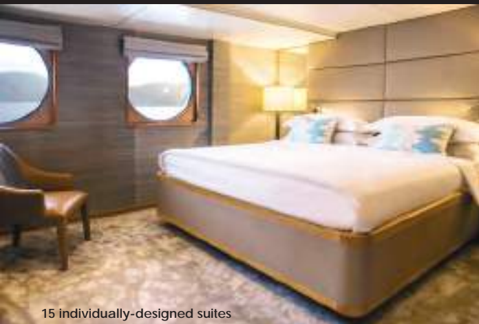
15 individually-designed suites