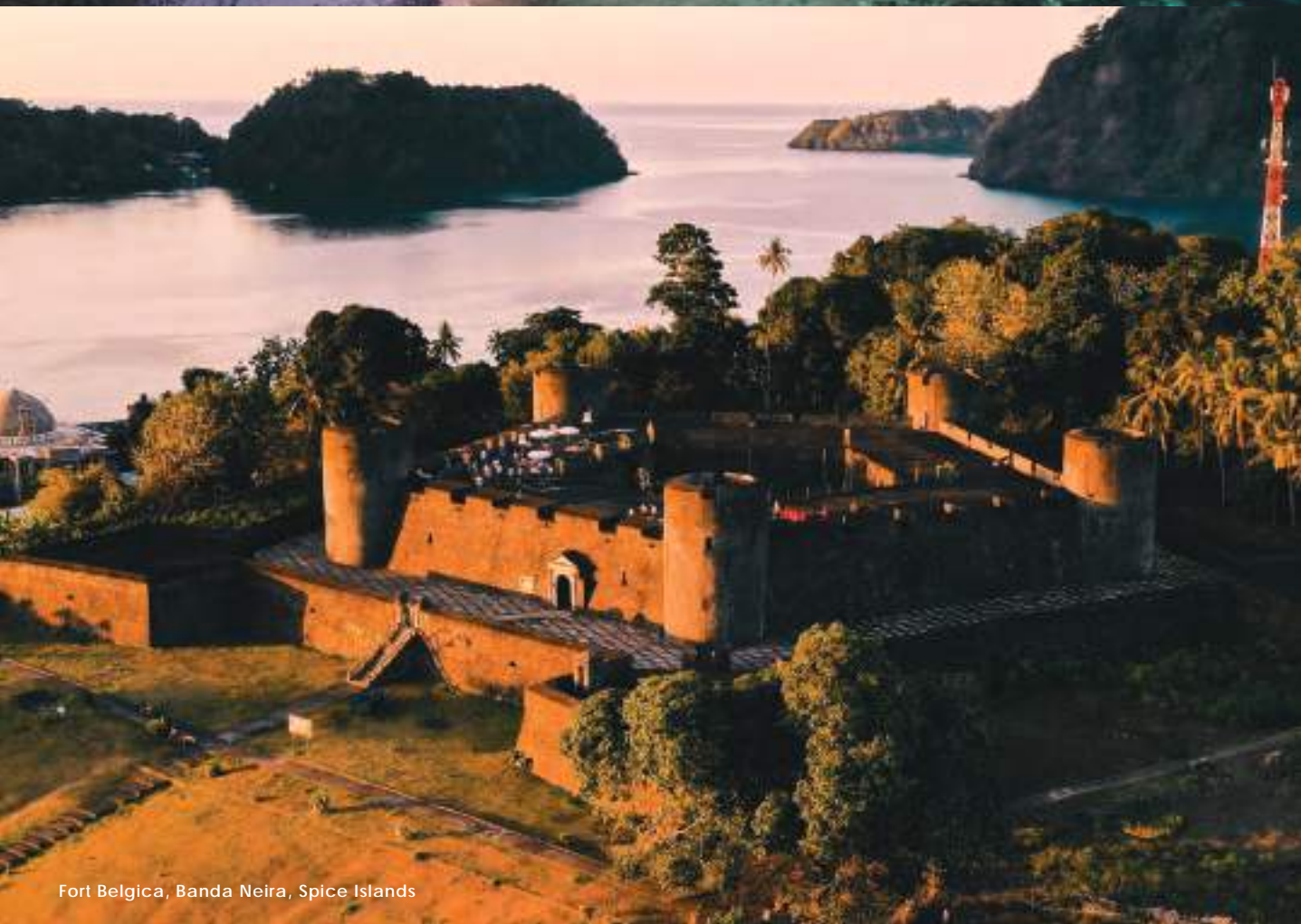
Fort Belgica, Banda Neira, Spice Islands