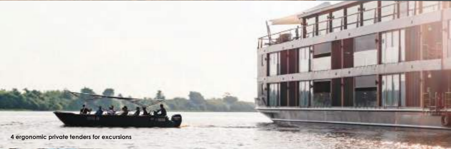
4 ergonomic private tenders for excursions