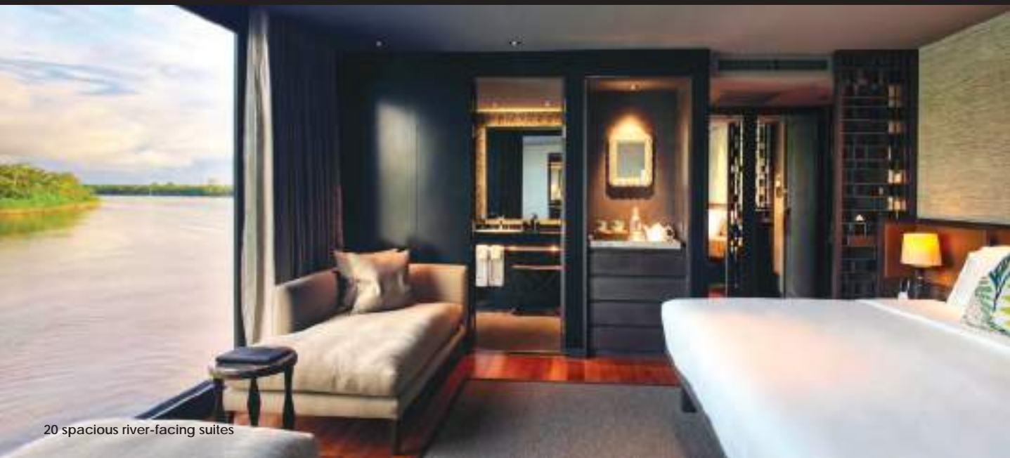
20 spacious river-facing suites