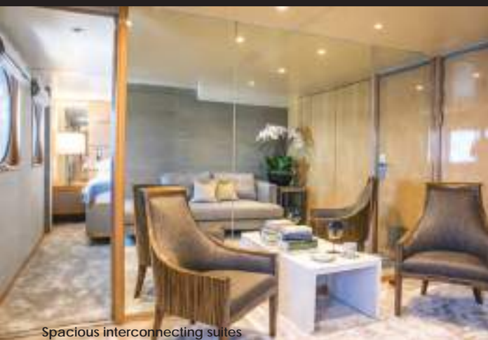
Spacious interconnecting suites