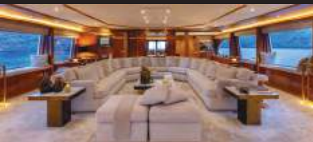
Share stories of your adventure-filled excursions while relaxing at the main lounge