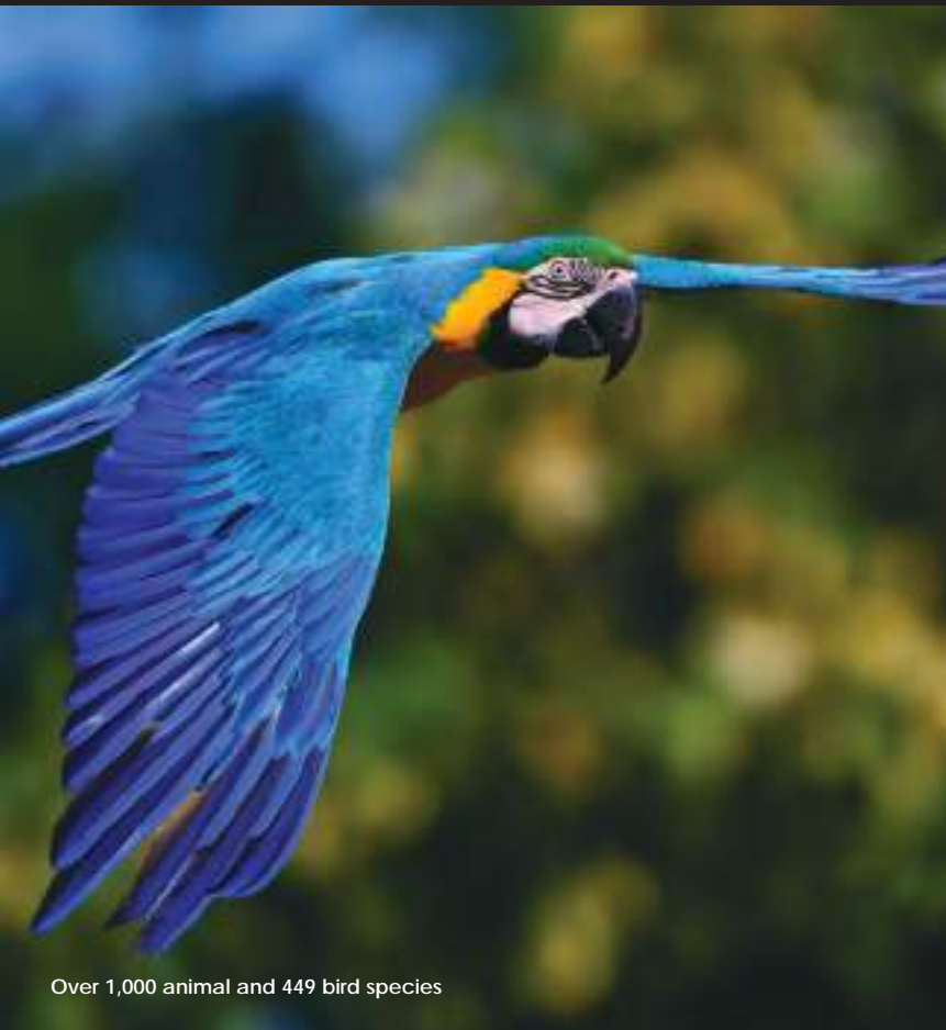
Over 1,000 animal and 449 bird species

OUR RIVER CRUISES GIVE YOU ACCESS TO THIS WILD PARADISE.