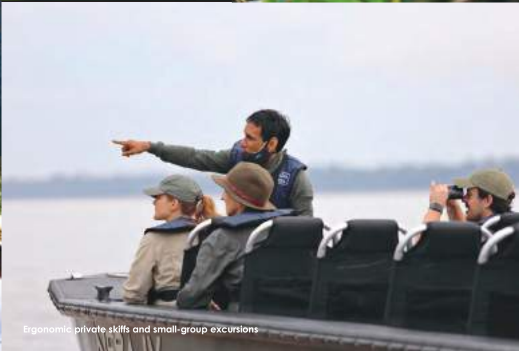
Ergonomic private skiffs and small-group excursions