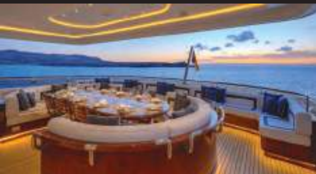
Enjoy Aqua Mare's diverse and dynamic cuisine served al fresco - perfect for appreciating the Archipelago's sweeping vistas