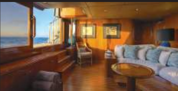
Wind down at our lower deck 'Beach Club' with its panoramic views