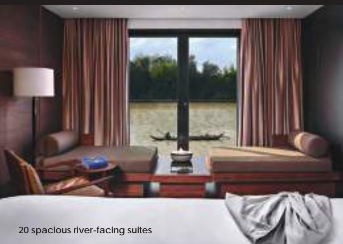
20 spacious river-facing suites