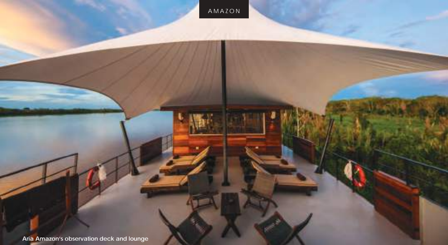
Aria Amazon's observation deck and lounge