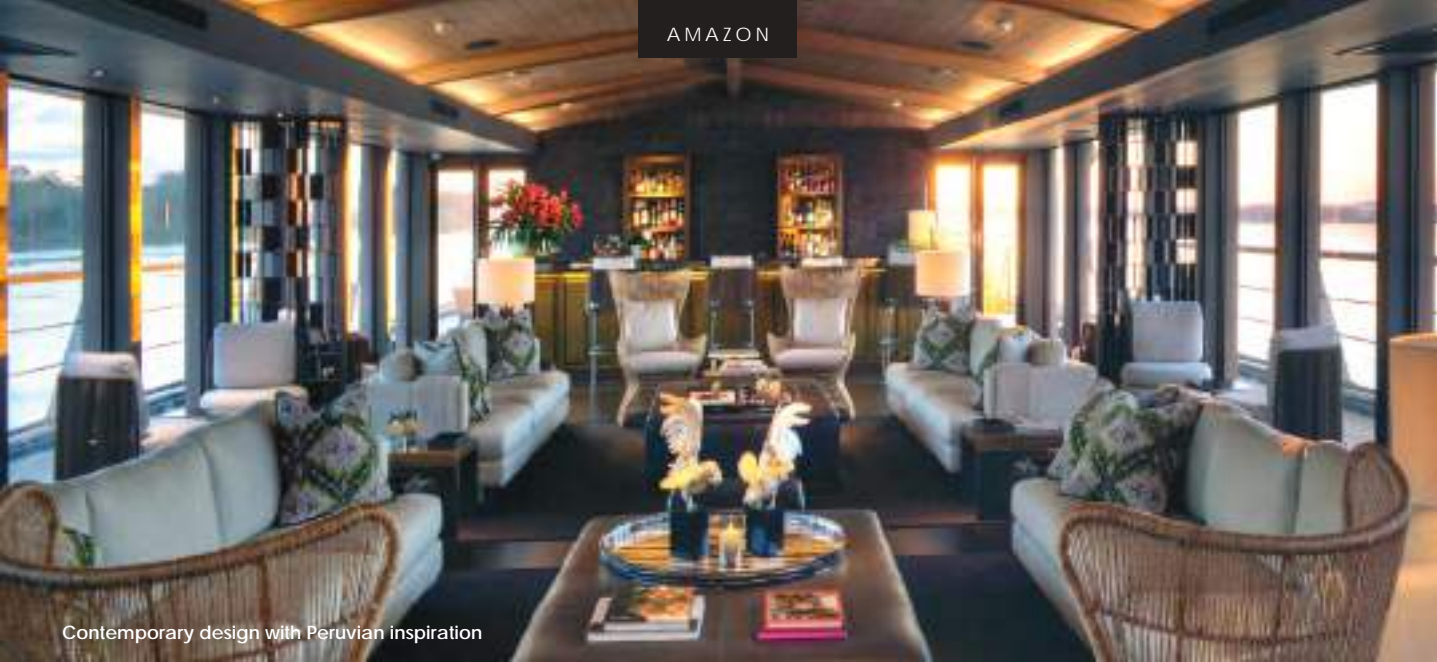
Contemporary design with Peruvian inspiration