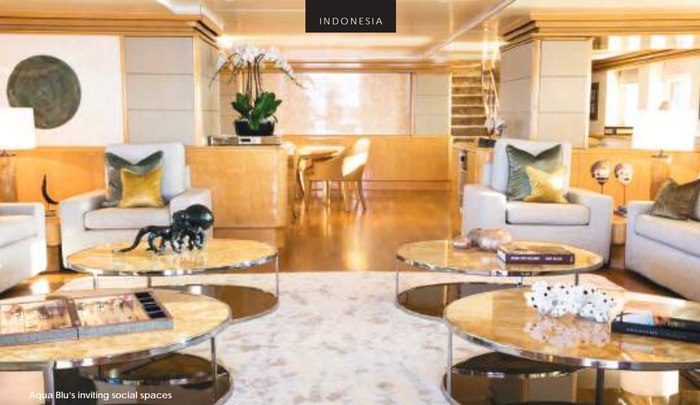
Aqua Blu's inviting social spaces